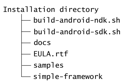
Figure 2-1 Mali SDK files and directories on Linux

After installation, the directories shown in Figure 2-1 are placed in your chosen installation directory: